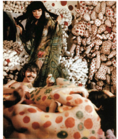
Above: Happening and fashion show in Yayoi Kusama's studio, New York, 1968.

AbEx was one technique of the body for those dedicated to the handmade, a way to throw shit down, mess shit up, and perform aggressive erasures.