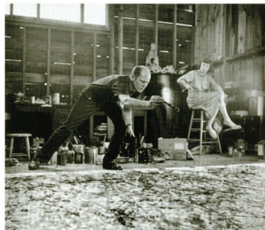
Above: Jackson Pollock painting One: Number 31, 1950, with Lee Krasner watching, East Hampton, NY, 1950.