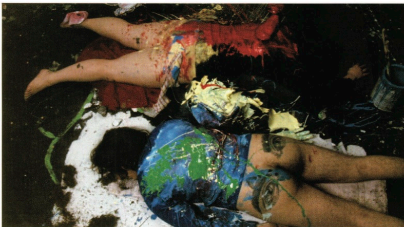
Leidy Churchman, Painting Treatments , 2010, stills from a two-channel color video, 19 minutes 54 seconds and 25 minutes 1 second, respectively.

AbEx was one technique of the body for those dedicated to the handmade, a way to throw shit down, mess shit up, and perform aggressive erasures.