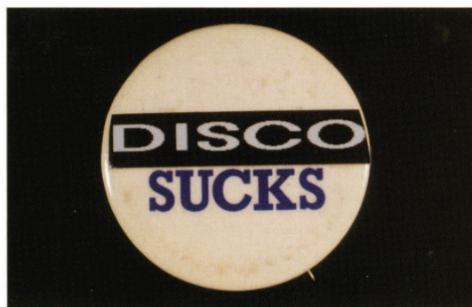
Above: DISCO SUCKS button, ca. 1978.

Later on, I could perform a more sophisticated maneuver by doubling back on and reversing the injunction against AbEx, performing a critique of the critique, one that allowed me to appropriate AbEx as a practice back into my own hands and twist it into the form I wanted it to assume. Camp is alive to a sense of the doubled, and same-old-same-old AbEx was ripe for double détournement . This reclamation amounted to reversing the reversal of its fortune. AbEx