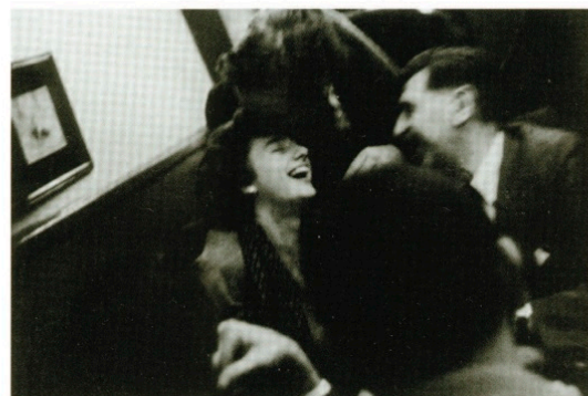
Above: Painter Grace Hartigan with friends at the Cedar Tavern, New York, 1959.