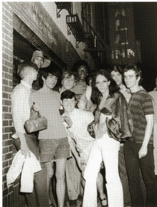
Below: Outside the boarded-up Stonewall Inn following the Stonewall riots, June 1969.

AbEx: Saw it? Loved it! Got the tote bag—and it came with a free Charlie Parker record!