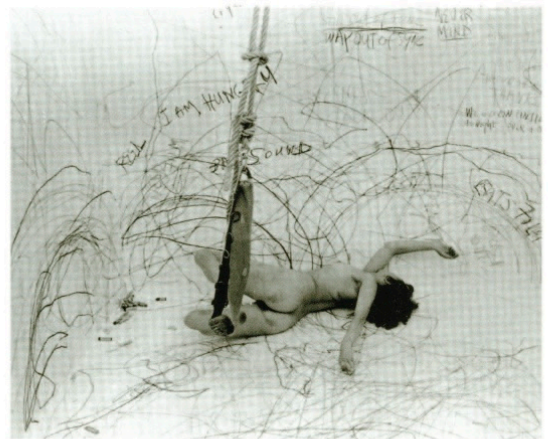
Below: Carolee Schneemann, Up to and Including Her Limits, 1973-76. Performance view, Studiogalerie, Berlin, June 10, 1976.