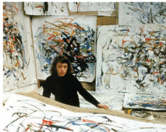
Above: Joan Mitchell in her studio, Paris, 1956.