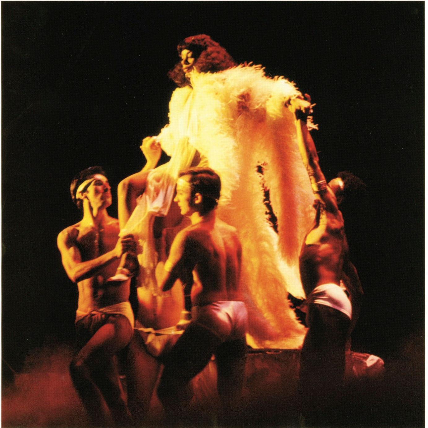
Donna Summer and dancers in concert, ca. 1977.